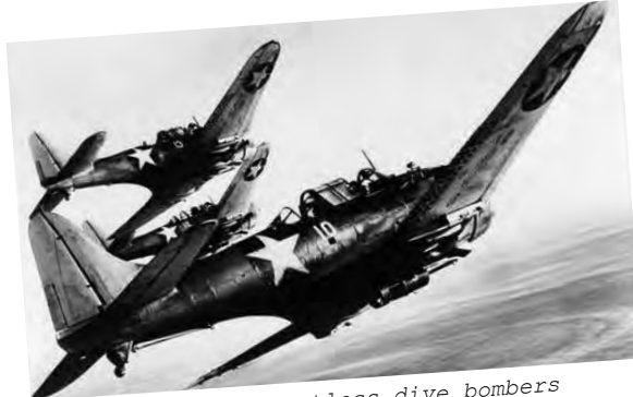
Three U.S. Navy Dauntless dive bombers on a fighting mission in the Pacific, 1943.

Wine Pairing. Chardonnay Clos du Bois. full-bodied with a rich, silky texture and a long finish. Brilliant silver straw yellow in color. Intense aromas of apple blossom, ripe pear, and sweet lemon drop are complemented by toasty oak ... 7 glass