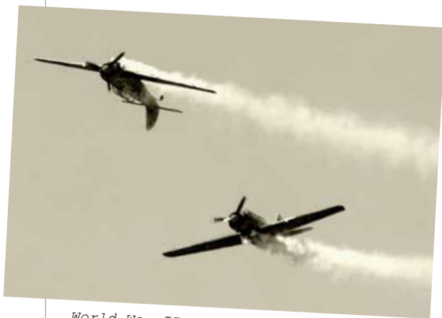
World War II airplanes in a dogfight

Crunchy Fritos smothered in homemade Texas chili, topped with pulled pork, shredded cheddar cheese and garnished with chopped onions ... 10