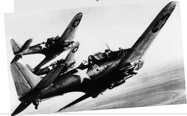
Three U.S. Navy Dauntless dive bombers on a fighting mission in the Pacific, 1943.

Moscato wine is famous for its sweet flavors of peach, orange blossom and nectarine ... 7 glass